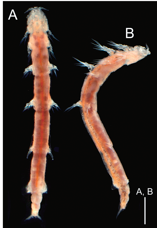
Fig. 3. Coloration of live specimen of Oshoroclausia shibazakii n. g. n. sp., holotype, adult female, NSMT-Cr 24117. A, habitus straight, dorsal; B, habitus curved, ventrolateral. Scale bar: 500 \mu m.

more than 10l of sediment. No additional specimens have been collected subsequently. One reason for the low encounter rate might be the above-suggested loose symbiotic behavior of copepods. If it is difficult to collect the copepod together with its host, it may be necessary to use meiofaunal collecting methods for efficient sampling because the copepod, when detached from its host, is functionally the same as meiobenthos.